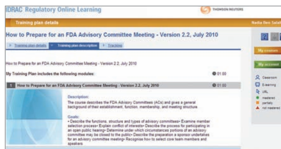
Example of course summary.